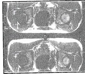
Fig 4: Double-line sign

AVN is diagnosed when a peripheral band of low signal is present in all imaging sequences, typically in the superior portion of the femoral head, outlining a central area of necrosis.