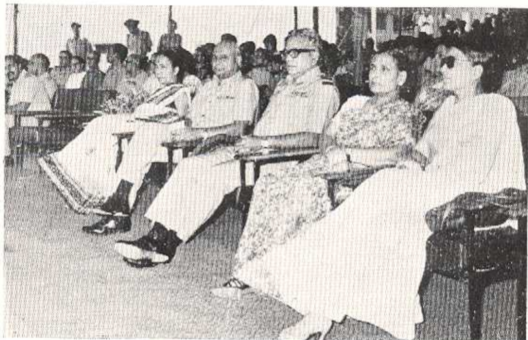
A view of the distinguished audience watching a cultural programme.