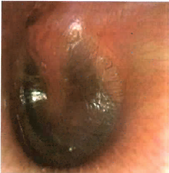
Fig 1: Grade II, injection plus slight haemorrhage within the substance of the tympanic membrane

Case No 2 – Pulmonary Pathology: 55 yr old lady, a case of right skull base osteomyelitis and diabetes mellitus type-2, presented with complaints of earache for the past seven months with ear discharge. She also had complaints of right sided facial weakness with difficulty in swallowing and deviation of the tongue to the right. In view of progression of disease while being on antibiotics, she was referred for HBOT. X-Ray of the chest showed Hyper-inflated lungs (Fig 2). A pulmonary medicine opinion was sought for fitness for HBOT. Despite her inability to perform a satisfactory spirometry owing to facial weakness, a provisional fitness was given by the pulmonologist based on lack of respiratory symptoms, PEF & FEV 1 values of 245L/min and 0.90.