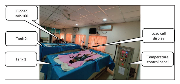
Figure 4: Complete experimental setup.

The research was undertaken with 10 healthy volunteers who were subjected to 24 h of DSI to simulate microgravity and study electromyographic changes in gastrocnemius muscle.