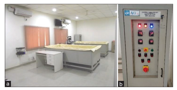
Figure 1: (a) Dry supine immersion tanks. (b) Central control unit.

The DSI tanks with a capacity of 1000 L of water were used to simulate weightlessness. The participants floated separated by a thin sheet of plastic [Figure 1a]. The tanks receive preheated water which circulates in a closed loop circulation system to maintain an isothermal water temperature of 34 \pm 0.5^{\circ} C. The water is heated using solar heaters and electric boiler. A tube-type heat exchanger has been integrated to ensure