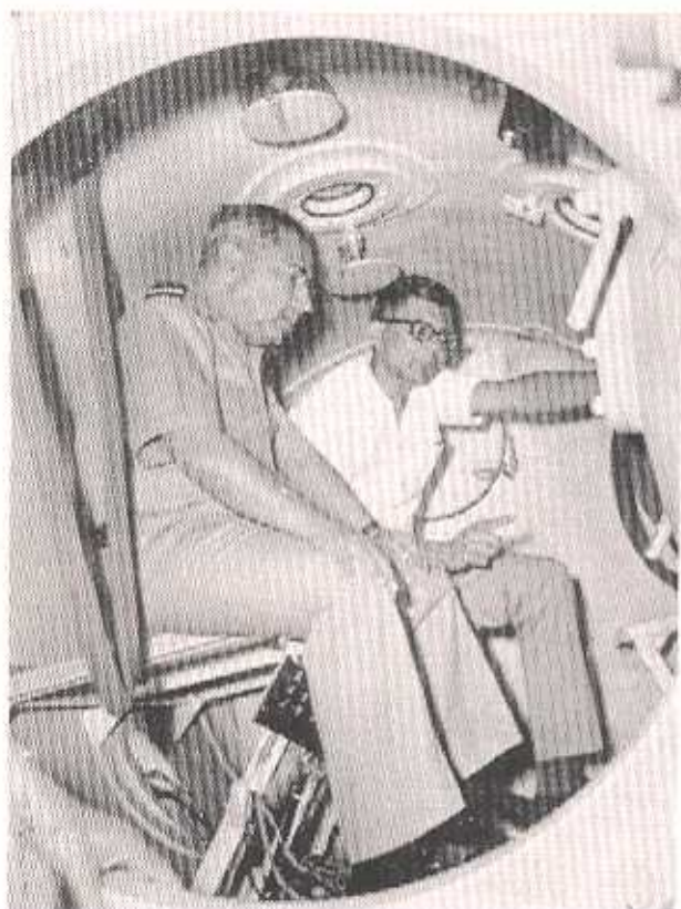
DMS (Air) in the Recompression chamber during his visit to IAM