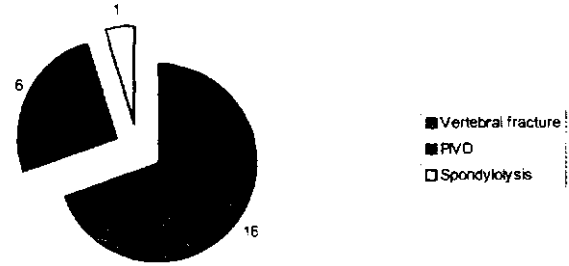
Fig-2: Nature of spinal injuries in aircrew