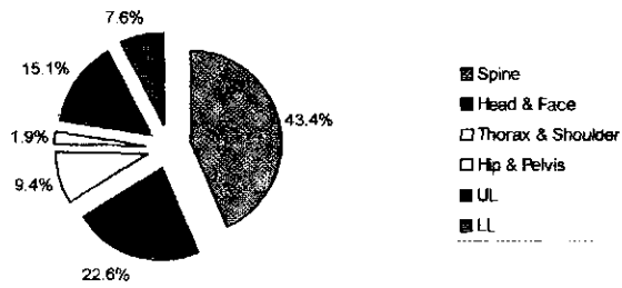
Fig-1: Region-wise distribution of injuries