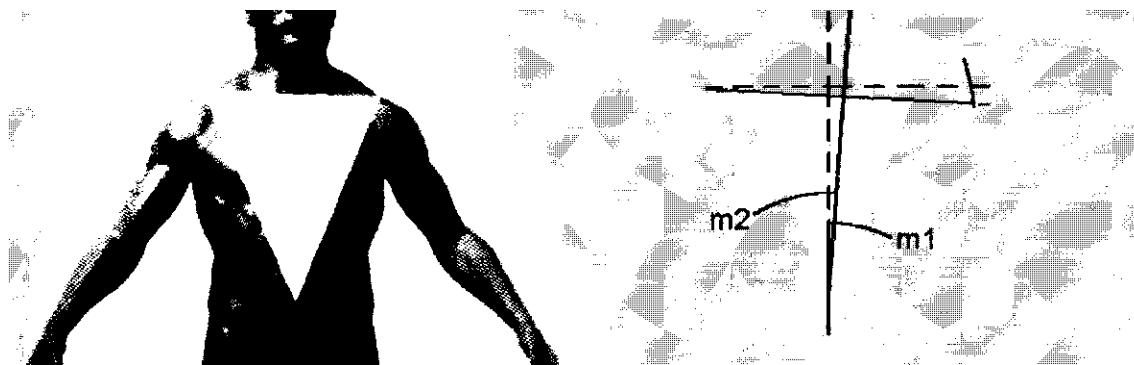
Fig 2: The upper body modeled down to a triangle for front view analysis.

Extracting the contour of the body from the image is a complex technique that requires a series of operations to be performed. Fig 3 depicts the different stages of processing employed to extract the contour of the body. The contours from both the pre and post therapy images are extracted and superimposed. A point common to both the contours is selected as the origin. Points corresponding to a given height are taken on both pre and post images and the angle subtended by these points at the origin is measured. These angles for both the pre and post therapy images are compared. In profile