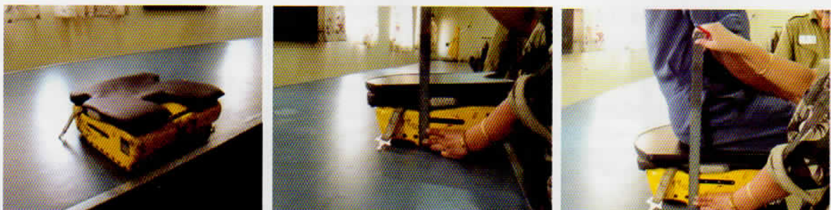
Figure 2. Height of seat cushion in Kiran Mk I showing compressibility

Study of ejection seat cushion compressibility factor: The seat pan with the cushion was placed on a hard surface in the ejection seat bay. A light