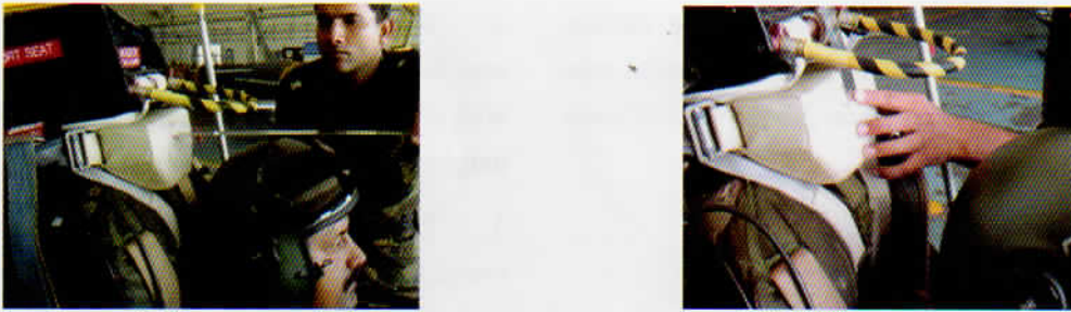
Figure 4. Measurement of distance between Mark 'A' and Mark 'B'

The helmet height is known from data collated on the anthropometry platform. Similarly seat compressibility factor is known from measurements done in the ejection seat bay. Filling these values and the measured max acceptable cockpit dimension (Mark A to SRP), the maximum permissible nude sitting height was calculated.