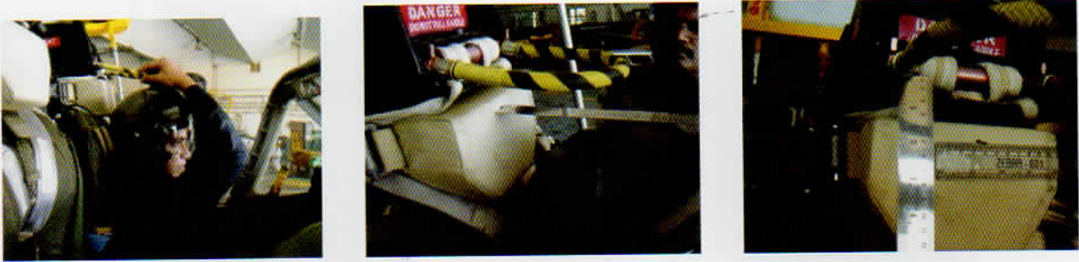
Figure 3: Ideal sitting position for operating overhead ejection handle and Mark 'A' on the Seat Headrest

wooden platform fitting on to the shape of the seat was placed on the top of the seat. The height of the seat was measured. A tall subject (nude sitting height of 94.5 cm) was made to sit on the seat. The height of the seat was again measured as shown in Figure 2. The differences in the height of the seat with and without subject revealed the seat compressibility factor.