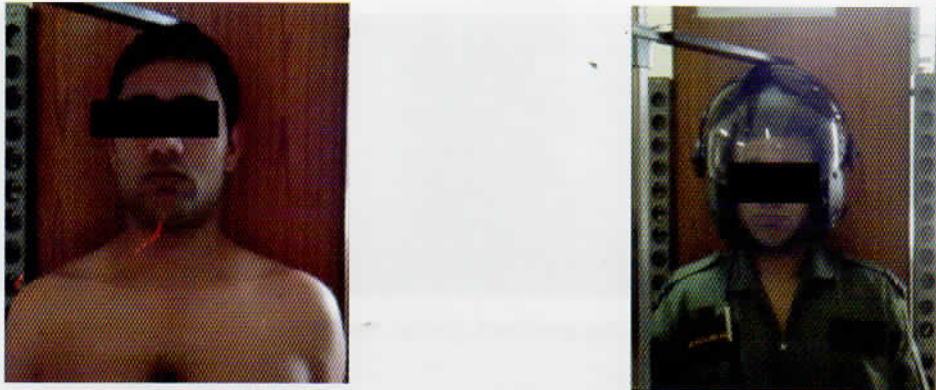
Figure 1: Measurement of nude Sitting Height and LWIH Helmet

6 inches. Due to this slotted adjustment, subjects within one inch difference in sitting height would prefer the same slot.