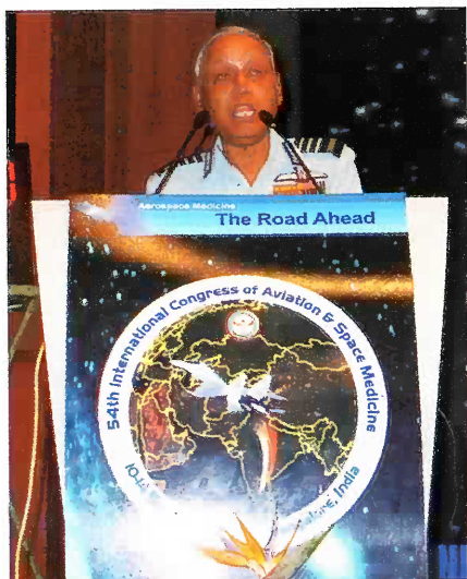
Fig 3: CAS addressing the Congress