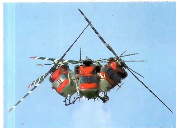
Fig 9: Display by the Sarang Team

mission to moon' and gave the road map towards achieving this goal, which would entail dedicated work and aeromedical advise.