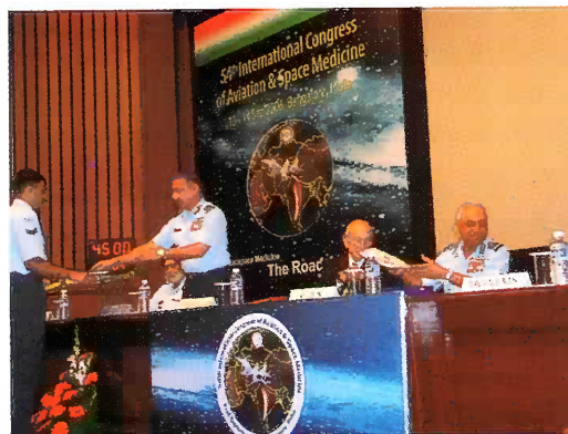
Fig 4: AOC-in-C, TC IAF releasing the Souvenir