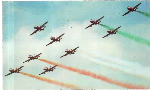
Fig 8: Display by the SKAT