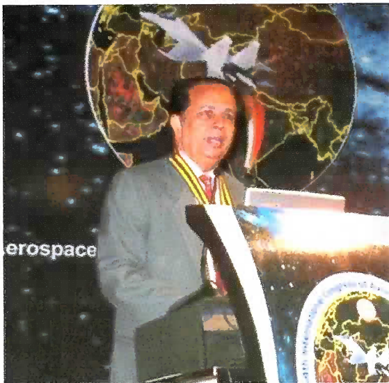
Fig 7: Shri G Madhavan Nair delivering Subroto Mukherjee Memorial Oration.