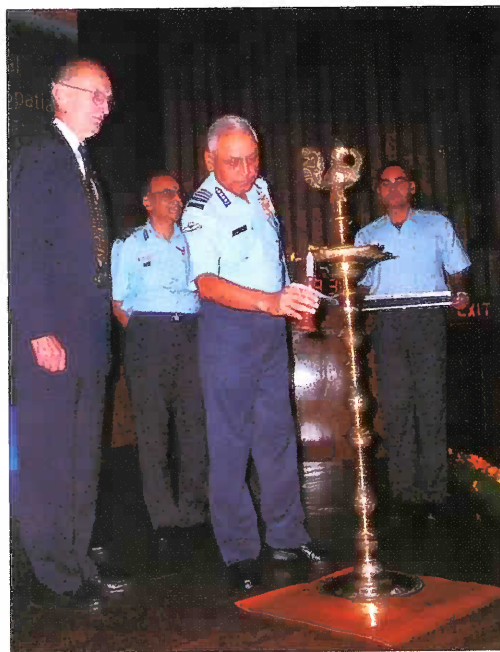
Fig 2: CAS inaugurating the Congress