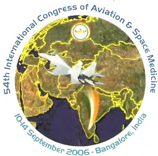
Fig 1: 54 th ICASM Logo