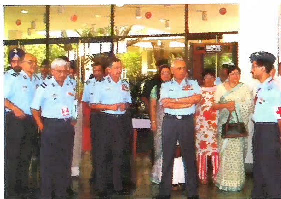
Fig 6: CAS witnessing the MTC demonstration during Scientific Exhibition