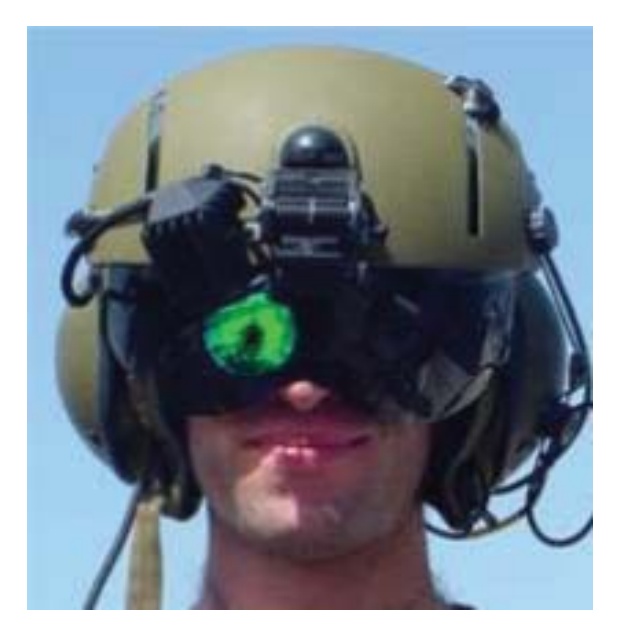
Fig-5 Day HUD system

Mounting of the ANVIS HUD-24 system. In the day-HUD system, the connector is directly fitted over the mount on the helmet in place of the NVG. In the night-HUD system, the add-on adapter is fitted over the objective piece of the NVG. The procedure of mounting and removal of both day and night HUD systems was easy and did not present any difficulty during both pre- and in-flight conditions.