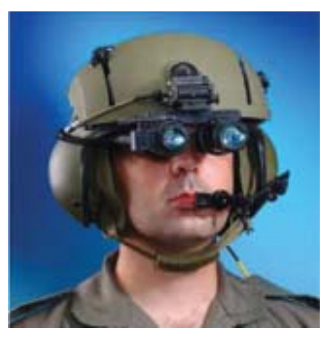
Fig-6 Night HUD system

Operation of the knobs for adjustment. In the night-HUD system, the add-on adapter is fitted over the objective piece of the NVG. Hence, other than the adjustment knobs already available for the NVG no separate adjustment knobs are provided to the night-HUD system. In the day-HUD system, the adjustment knobs are located over a flat platform attached to the day monocle connector. These knobs were easy to operate. There was no difficulty in the adjustment of various knobs. Operation with gloved hand was satisfactory.