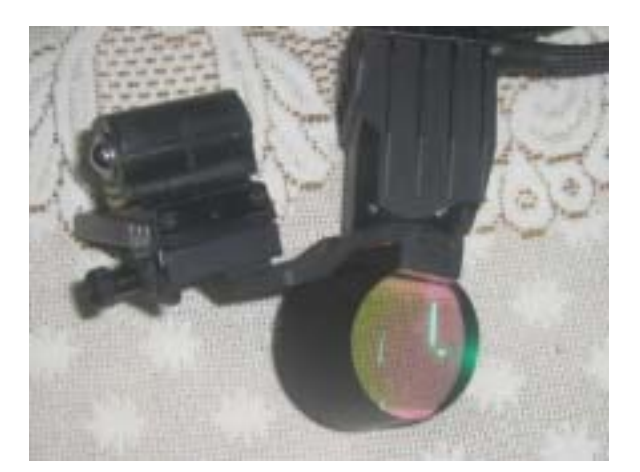
Fig-1 Day HUD monocle

(iii) Diameter of the distal surface = 45 mm(iv) Diameter of the proximal surface = 35 mm