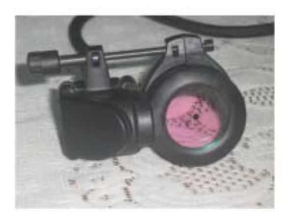
Fig-2 Night HUD adapter

(iii) Diameter of the add-on adapter excluding the outer rim = 25 mm