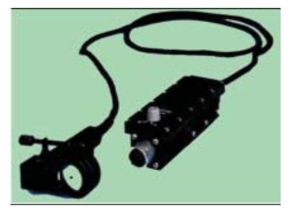
Fig-4 Night HUD system

(i) Add-on adapter to NVG: This adapter can be fitted over the objective piece of the Night Vision Goggle on either side. After fitting the adapter, it can be further tightened by a screw