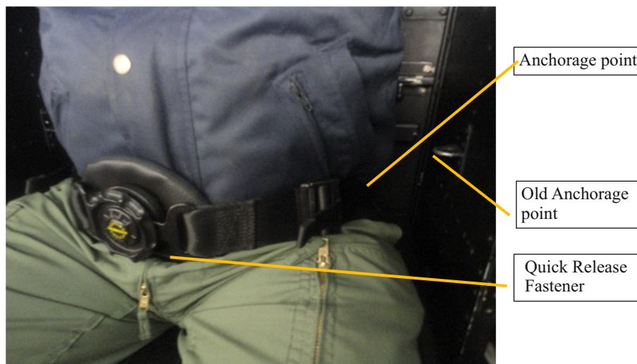
Fig - 3: Anchorage mechanism for lap belts