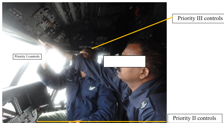
Fig - 2: Cockpit trial for short subject